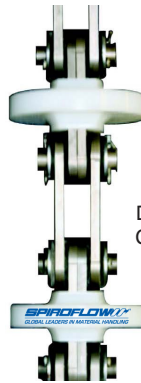
Dynaflow™ Chain Drag